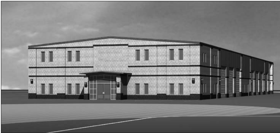
artist's rendering of new Midwest hub in Joliet, Illinois