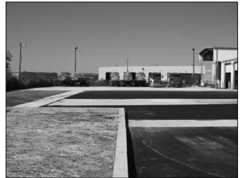
Smooth asphalt and concrete curbs make it much easier to maneuver tractors. Concrete landing pads provide increased stability for trailers.

ers is conducted more efficiently on a paved surface.