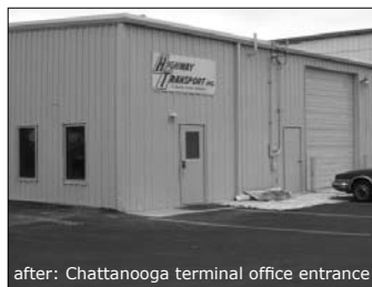
after: Chattanooga terminal office entrance