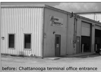
before: Chattanooga terminal office entrance

Finally, paved facilities improve community relations by providing a neater appearance, reduced dust production and tracking of debris onto neighboring roads.