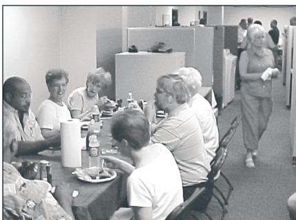
Knoxville | Several employees from the Baum Drive location visited the Knoxville terminal location.